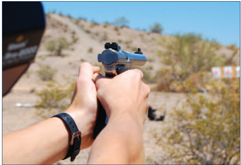
Firearms generate high dB Levels (100 – 165 dB).