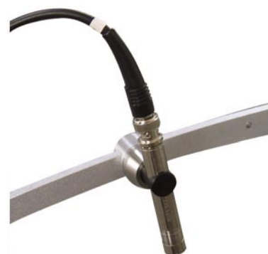
Microphone Mounting for MF710 and MF720